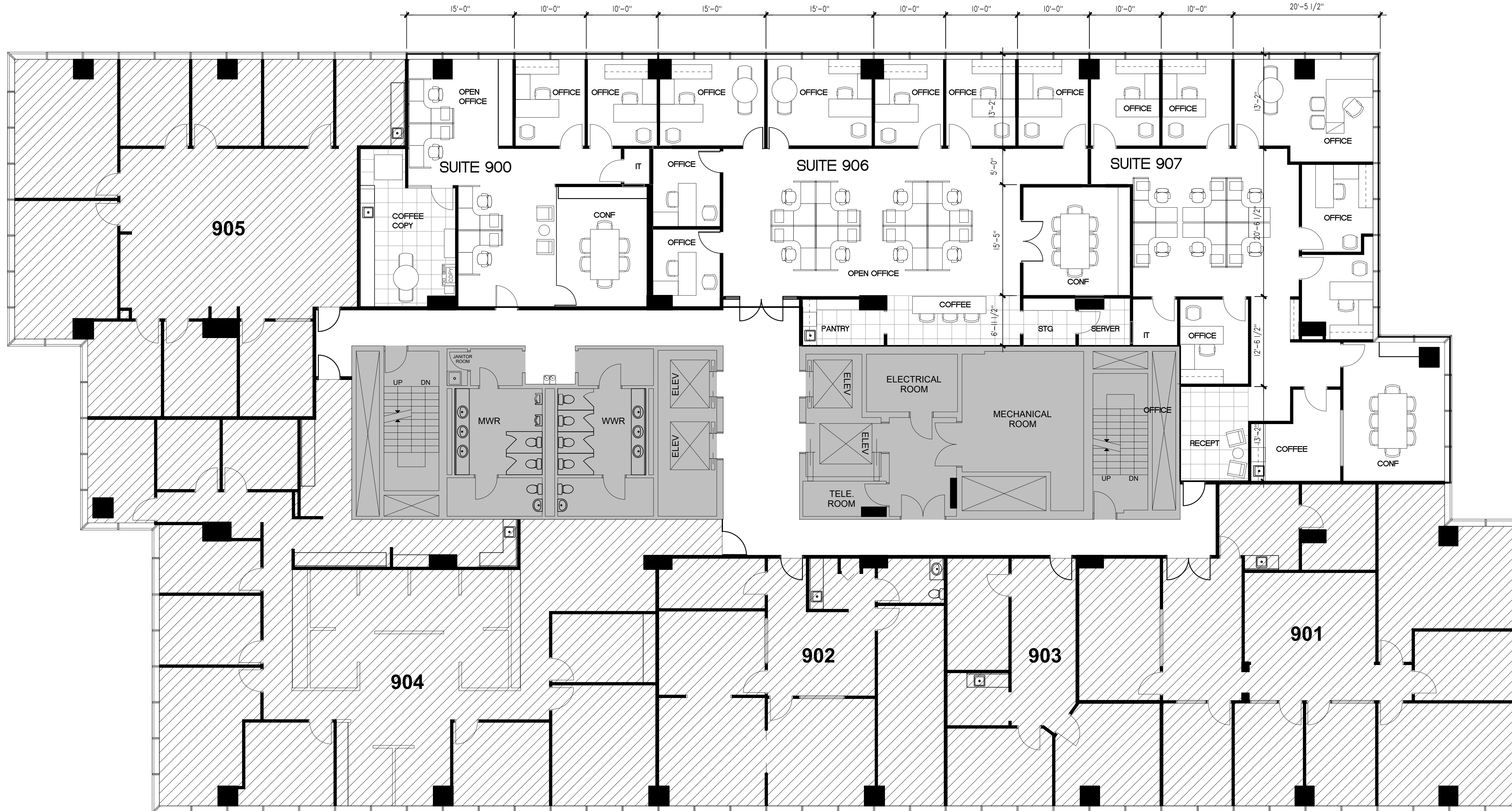
SPACE PLAN SP-9 SCALE: 1/8" = 1'-0"